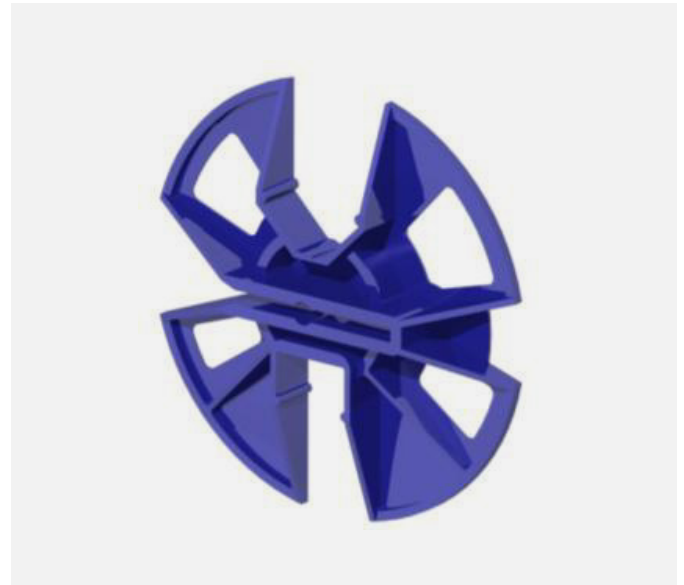
ACS Multi-Purpose Insulation Retaining Clip

The Two Part Tie allows a separate inner section to be built into the block or internal leaf, leaving a short slotted connection exposed for the connection of the outer sections, which are installed during the construction of the outer leaf. The standard inner sections are available in two standard lengths, either 170mm or 220mm in length to suit a maximum insulation board thickness of 70mm or 120mm consecutively (alternative lengths are available upon request). The Two Part Tie requires an embedment of 62.5mm into the bed joint in both leaves. The outer sections are available in a range of lengths to suit cavities from 150 - 400mm.