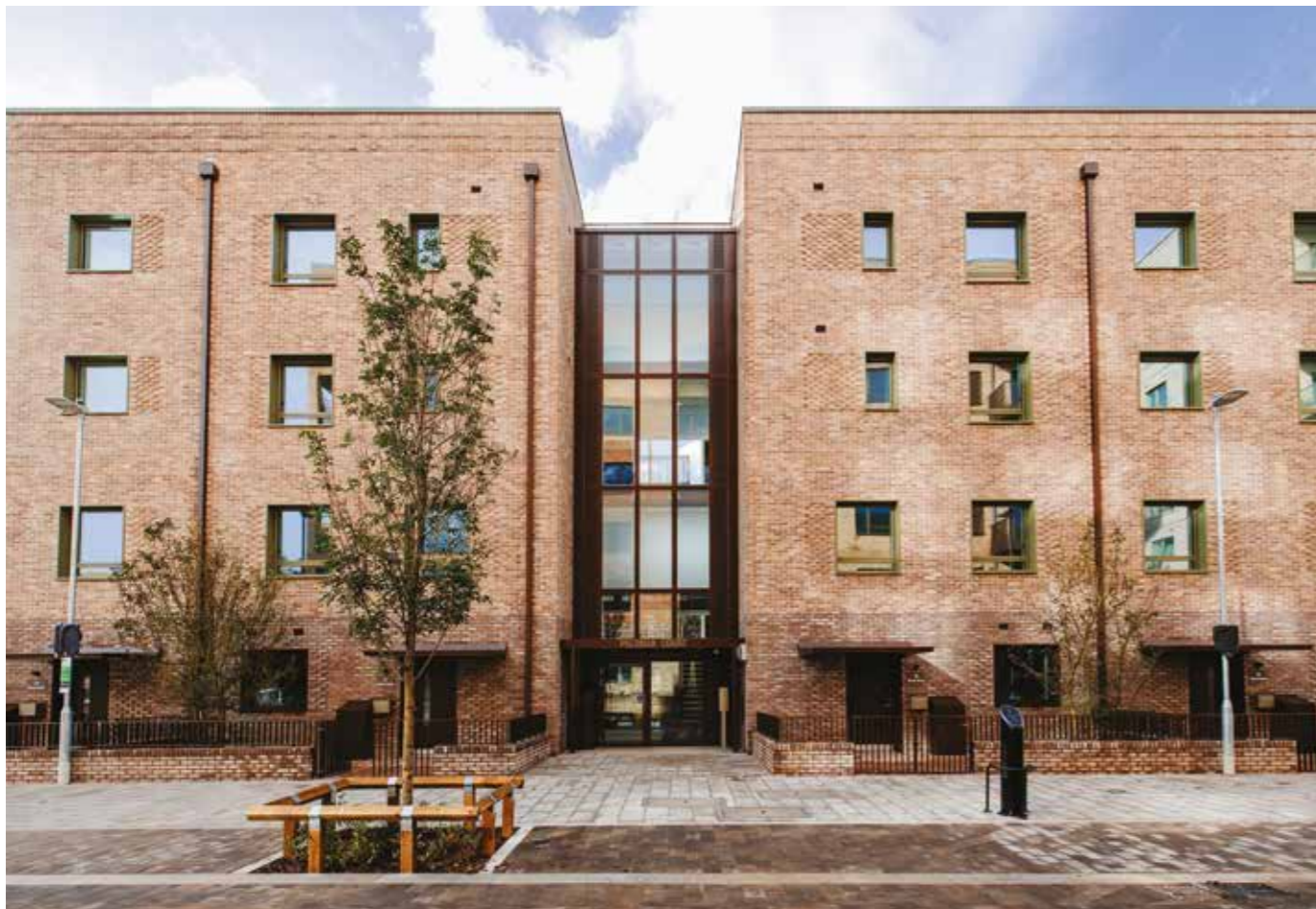
Top left — Riverside House, Guildford, Stelling Properties